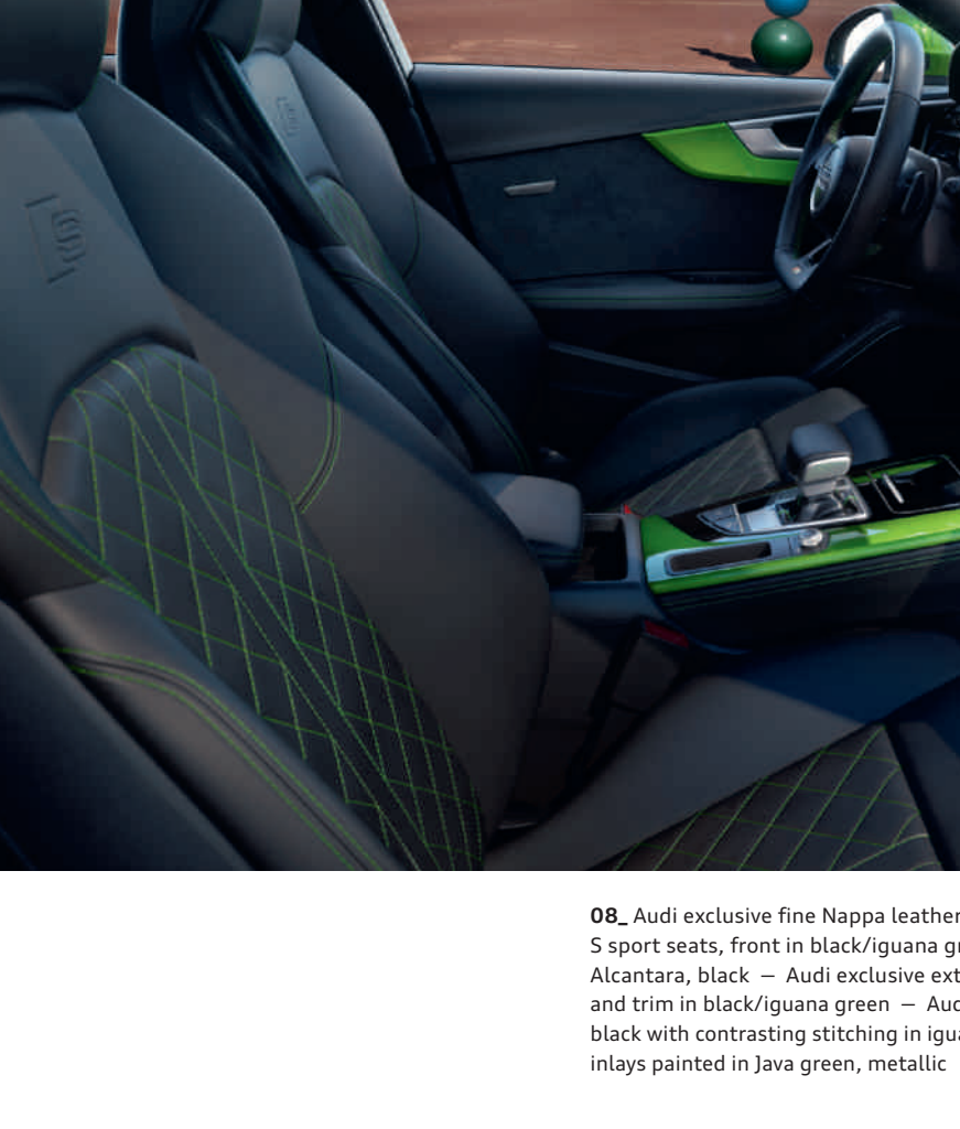
08_ Audi exclusive fine Nappa leather upholstery and trim with S sport seats, front in black/iguana green — door trim inserts in Alcantara, black — Audi exclusive extended leather upholstery and trim in black/iguana green — Audi exclusive controls in leather, black with contrasting stitching in iguana green — Audi exclusive